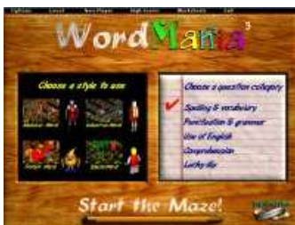
Maze Menu – the four maze worlds and question categories