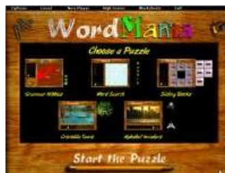
Puzzle Menu – five independent tasks to tackle between mazes