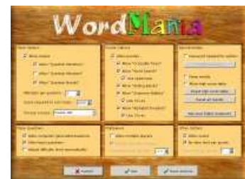
Customise the software with its flexible ‘Options’ panel